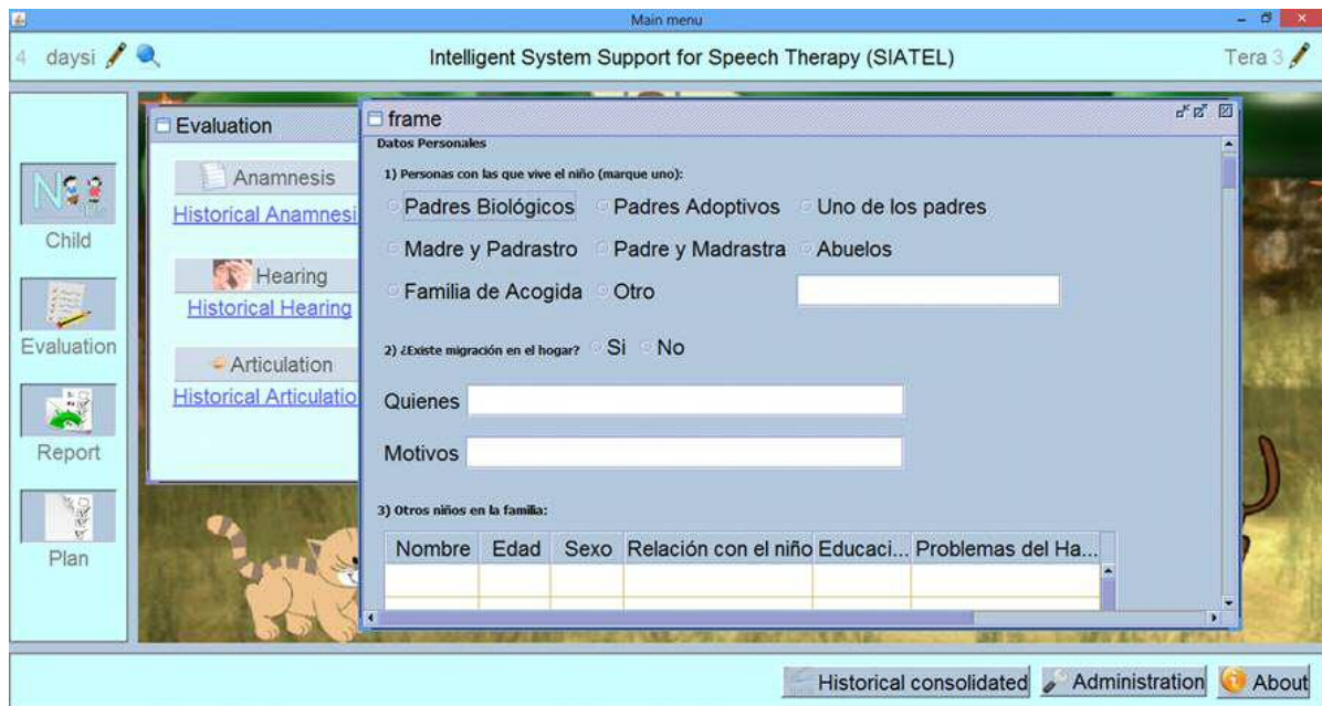
Figure 4. A screen capture of the anamnesis menu of the desktop application.